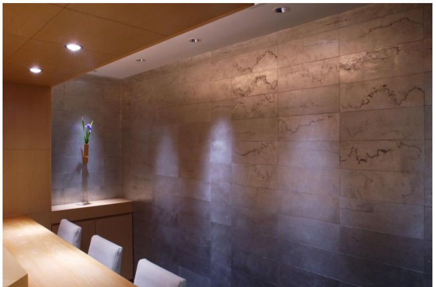
Sushi Restaurant in Tokyo

In a darkened restaurant, MOONLIGHT provides a bright glow