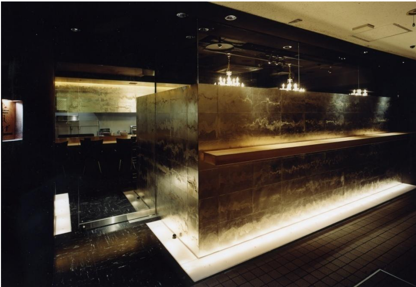
Modern Restaurant Counter

Out of Japan comes a new approach to interior decorating. MOONLIGHT the material beloved by the Japanese royal family can now adorn your surroundings, enveloping you in a soft glow that transforms with the change of light.