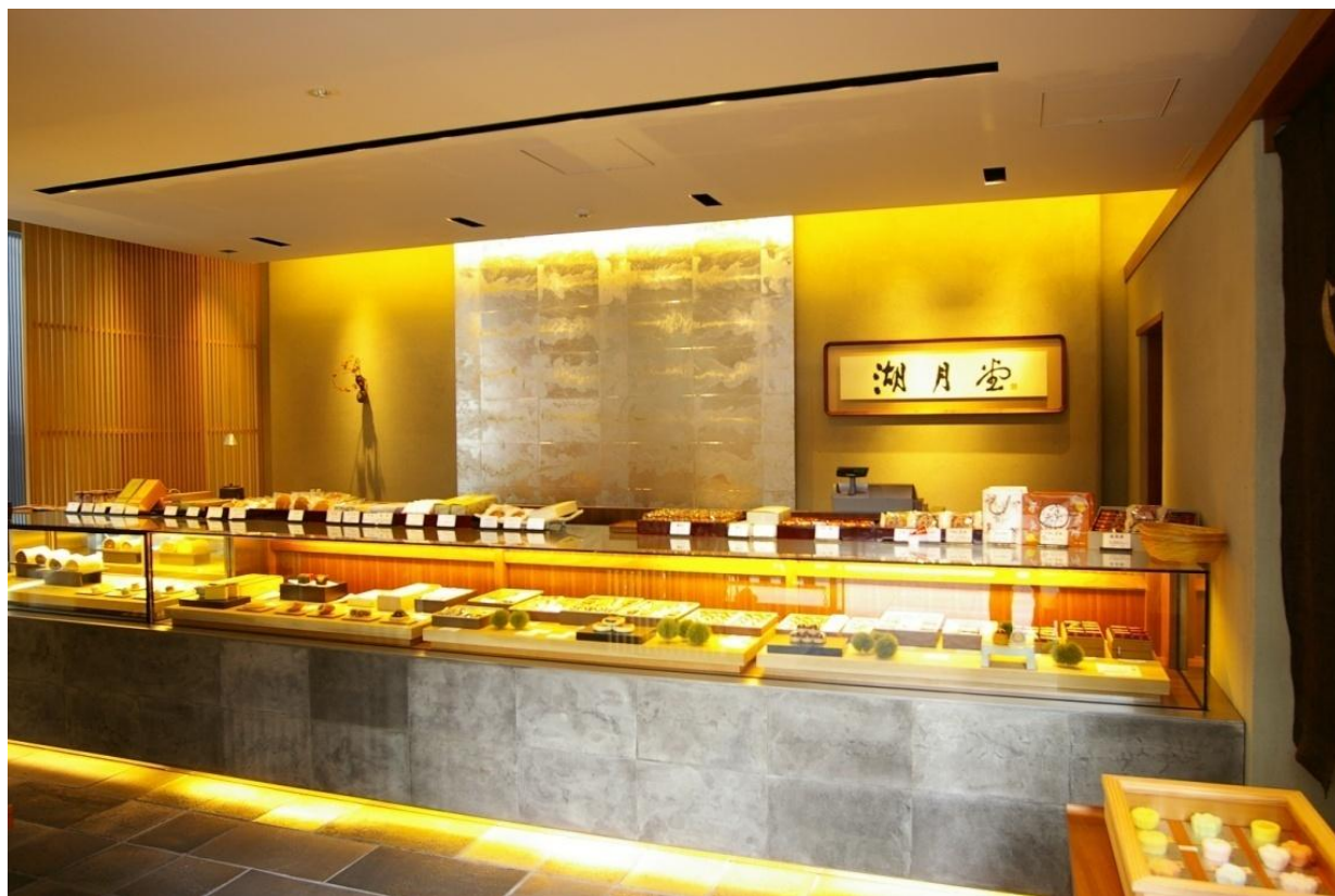
Traditional Japanese Patisserie

A renowned Japanese patisserie chose MOONLIGHT to enhance their artistic sweets.