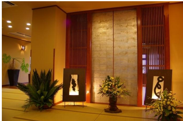
Traditional Japanese Inn

Tashiro Alloy Inc. was established in 1914 almost a hundred years ago. In our company there are 5 employees. Our main business is producing alloys, mainly nonferrous metals. Our company is not well-known by the general public but we are well-known in the metal Industry.